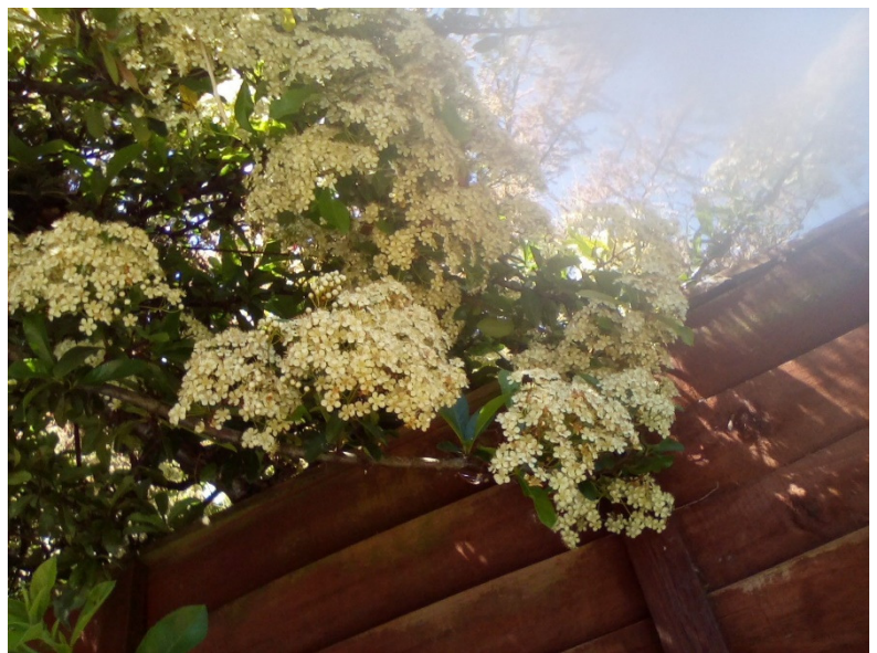
'Propeller Plant' by Elowen Ford Y1